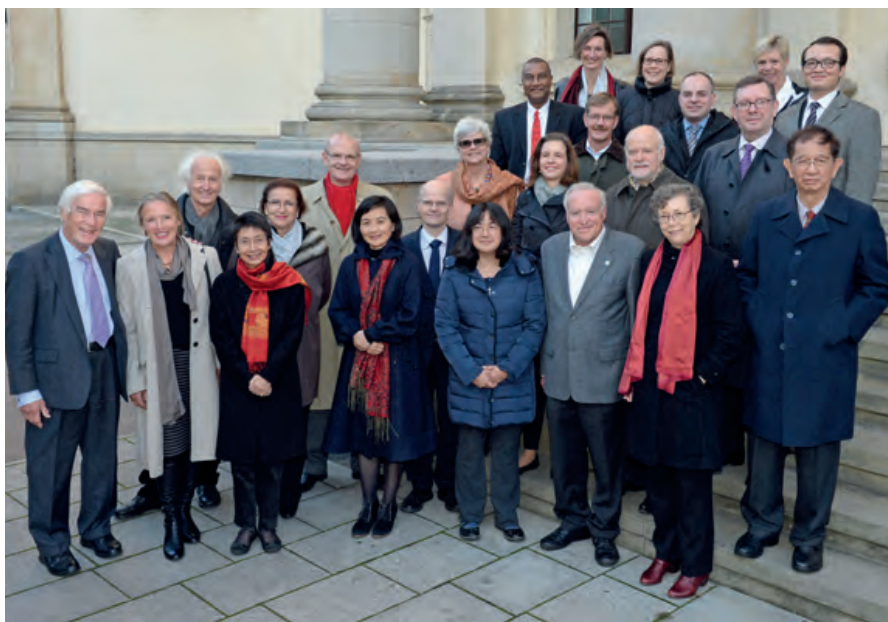
The International Advisory Board and Humboldt Foundation staff members at the 2014 IAB Meeting

The International Advisory Board supports the Humboldt Foundation's strategic planning. As an independent expert group, it addresses current developments in global academic markets and identifies topics of special strategic concern for the Foundation and its partners in Germany, the United States, and beyond. ■